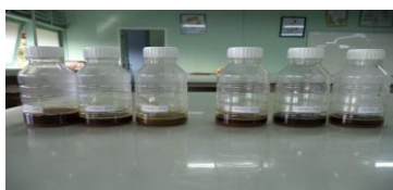
Figure 1. Results of Guava Leaf Extract Rough Guava Leaf Water Content

Yield results obtained as shown in Table 1 indicate that the solvent composition of 70% ethanol has a higher yield is 11.37% rather than solvent composition lainnya. Pada this study all results rendemennya extractive or brownish yellow as shown on the Figure 1.