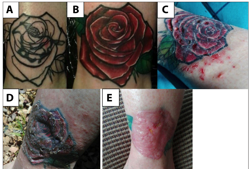
Fig. 1. (A) Original black ink tattoo outline. (B) Completed tattoo. (C) Early reaction to the red ink in the tattoo. (D) Late reaction in the tattoo, showing loss of dermal volume. (E) Final outcome of surgical excision and skin graft.

The presence of tattoos has an effect on clinical assessment, diagnostic tools and treatment modalities of many conditions. In burns, tattoos affect the histology, use of diagnostic dyes, laser Doppler imaging and magnetic resonance imaging (MRI). [51-56]