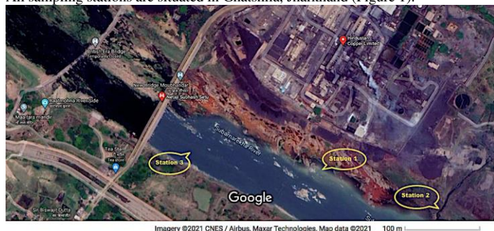
Figure 1 Google satellite image showing three sampling stations ( https://www.google.com/maps/search/ghatshila,+hindustan+copper+limited/@22.5911511,86.4454325,4927m/data=!3m1!1e3 )

river itself commonly designated as Station 1 (22.5954° N, 86.4519° E), Station 2 (22.5962° N, 86.4522° E) and Station 3 (21.3325° N, 87.2341° E) respectively. All sampling stations are situated in Ghatshila, Jharkhand (Figure 1).