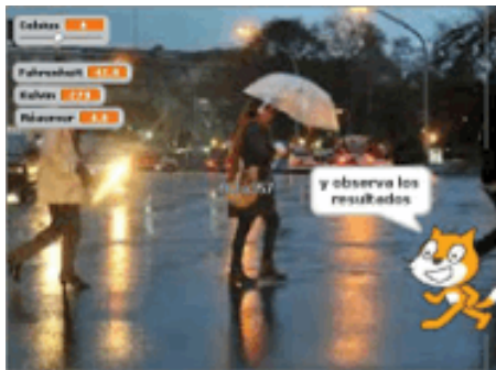
(b). Project Results