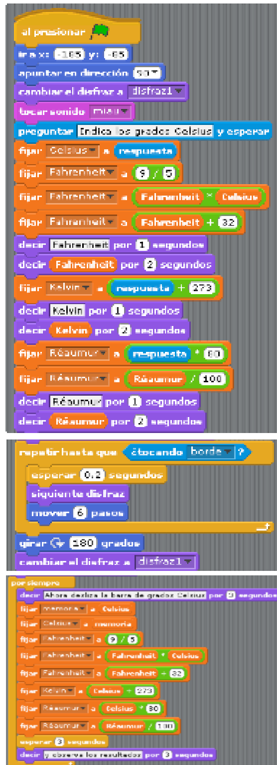
Figure 2. Project blocks

The project methodology is based on the case study. It is proposed as the way to get to the problem, considering the most appropriate method to understand existing discourses in a unique context [10] (Yin, 2003). The case study is developed with a class of 25 students (1st Year) in a high school from Jaén (Spain) and a Natural Science teacher. It is the first time they access a similar experience applying the Scratch language to the curriculum of the subject. The teacher has no previous experience in this area of technology integration in the classroom. The sessions take place in the classroom because it is an ICT center with computers in every classroom. The purpose of using the Scratch language is creating a program and sharing it with the online community. Thus, if the student is capable of creating a suitable program in those twelve sessions, we can see that the overall goal mentioned is fulfilled. Taking into account the students' work, a set of criteria listed in the rubric was proposed in order to ensure that the result is right.