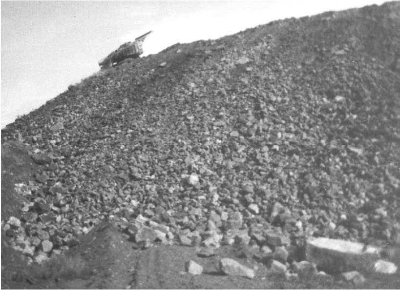
Fig. 1. Uneven structure of gob dump originate from peripheral technology.