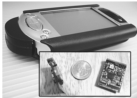
Figure 16-2. Mobile MITes.

Dramatic improvements in the size, performance, and comfort of on-body physiological sensors for ambulatory monitoring are being made in laboratories, and