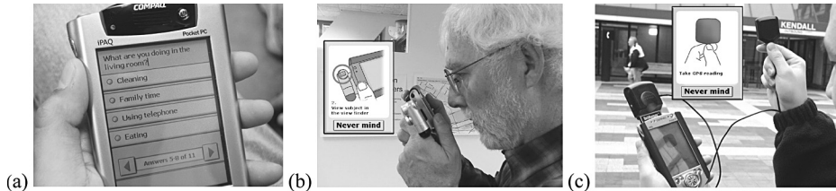
Figure 16-1. Screen shots of MIT CAES software.

particular part of the community, as determined by a GPS receiver plugged into the PDA and a GIS database.