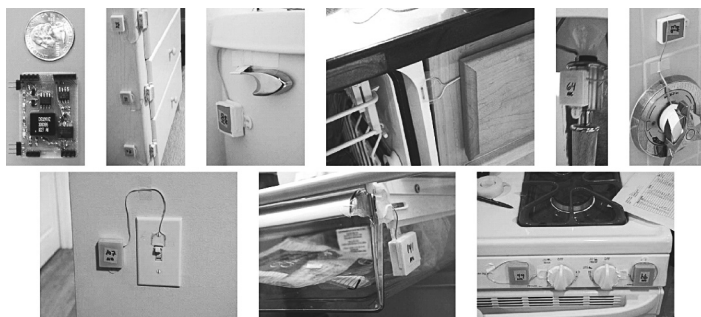
Figure 16-3. Early versions of MITes.

Other researchers are implementing similar activity-detection algorithms that use different types of environmental sensors. For example, Philipose and colleagues have created a bracelet with an embedded radiofrequency identification tag (RFID) reader. When a subject wears the bracelet and inexpensive RFID stickers are placed on objects in the subject's home, a computer system can detect when the subject touches each of the tagged objects. Algorithms that recognize everyday activities (e.g., making tea) can then be detected automatically, in real time (Philipose, Fishkin, Fox, et al., 2003). In combination with software on a PDA, such systems could be used for studies where the subject's behavior is monitored for specific eating patterns and then context-sensitive questions are asked during or after particular target behaviors.