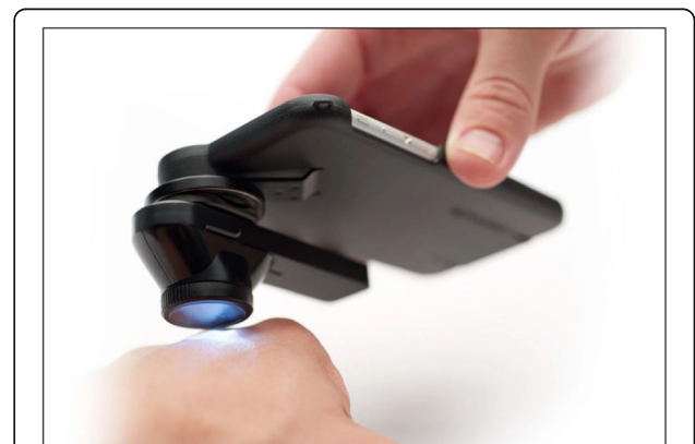
Fig. 1 DermLite Dermatoscope. DermLite ( www.dermlite.com ) works with virtually any smartphone and tablet

In this randomized controlled trial, we will prospectively enroll 720 HCT patients over a three-year period, and will use a comparative effectiveness design (Fig. 2) comparing: patient activation and education (PAE, N = 360 ), which consists of patient-directed print materials and text messaging (12 messages over a 9 m period) vs. PAE plus physician activation (PAE + Phys, N = 360 ), which also includes physician-directed activation/educational materials about: 1) survivors' increased skin cancer risk; 2) the benefits of and the skills needed to conduct full-body skin exams; and 3) the importance of recommending routine SSE to patients. Among the 360 survivors assigned to PAE + Phys, we will further randomize (1:1) the PCPs to receive either printed physician activation materials ( N = 180 ) or printed physician activation materials plus an e-learning module with access to TD (PAE + Phys+TD; N = 180 ), which includes provision of a dermoscopic lens to take photographs of suspect