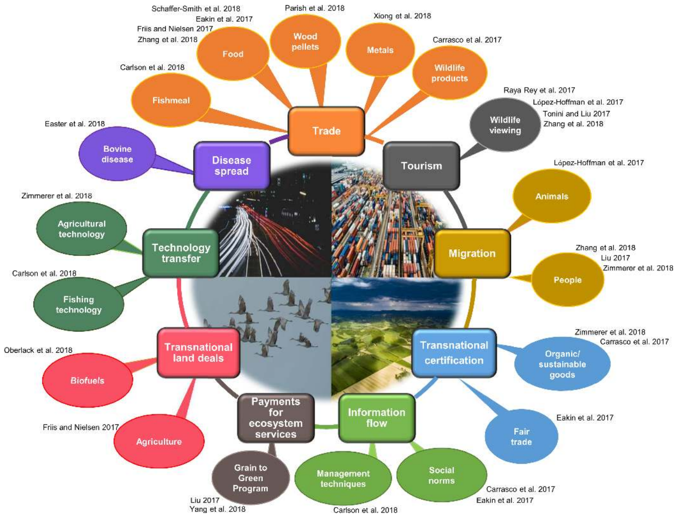
Fig. 1. Schematic illustrating the major telecouplings (on the circle) and associated examples (bubbles) explored in the special feature.

Hoffman et al. 2017), human migration (Carlson et al. 2018, Zhang et al. 2018), tourism (Raya Rey et al. 2017), payments for ecosystem services (Yang et al. 2018), transnational product certification schemes (Carrasco et al. 2017, Eakin et al. 2017), disease spread (Easter et al. 2018), transnational land grabbing (Oberlack et al. 2018), technology transfer (Zimmerer et al. 2018), and information spread (Carrasco et al. 2017, Carlson et al. 2018).