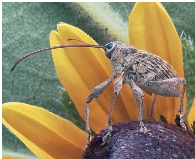
Fig. 1. Curculio proboscideus (Curculionidae: Curculioninae) perched atop a flower of Helianthus sp. (Asteraceae). Note the elongation of the head to form the characteristic weevil rostrum or “snout.” In some groups, the rostrum is not only used for feeding, but also for preparing oviposition sites and placing eggs deep inside plant tissues.

Weevils first appear unequivocally in the Late Jurassic fossil record (Karatau, Oxfordian-Kimmeridgian, 161.2–150.8 Ma) (5). These early weevils belong to the family Nemonychidae (2) and most likely developed in the reproductive structures of conifers in a manner similar to living nemonychids (6, 7). While early weevils most likely fed on conifers, most living weevil species are specialist herbivores on flowering plants (angiosperms; >250,000 living species). Shifts to feeding on angiosperms are associated with enhanced taxonomic diversification