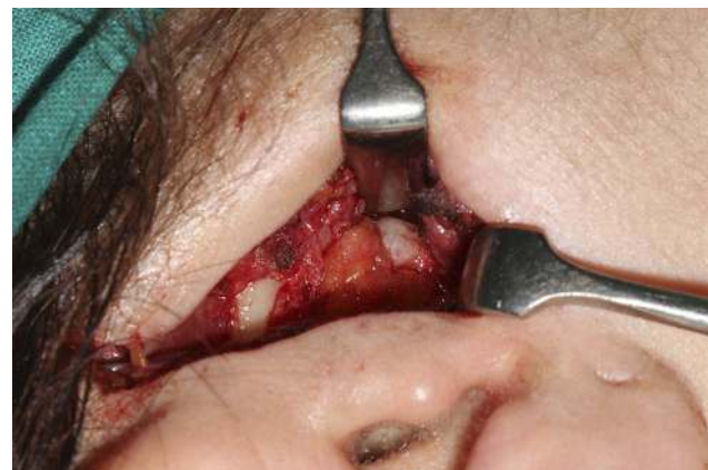
Figure 4 Intraoperative view of the temporomandibular joint showing a dermis interposition graft after discectomy.

The primary goal of alloplastic total TMJ replacement (Figure 5) is the long-term restoration of mandibular