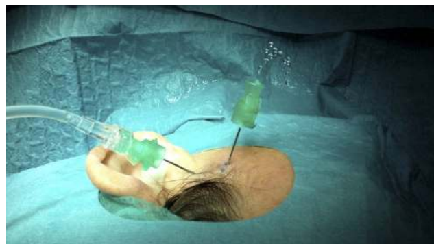
Figure 1 Arthrocentesis of Temporomandibular Joint.

Arthroscopy can be undertaken, with the patient receiving a local (usually in a single-puncture observation of the joint) or general (most often in an operating room) anesthetic.