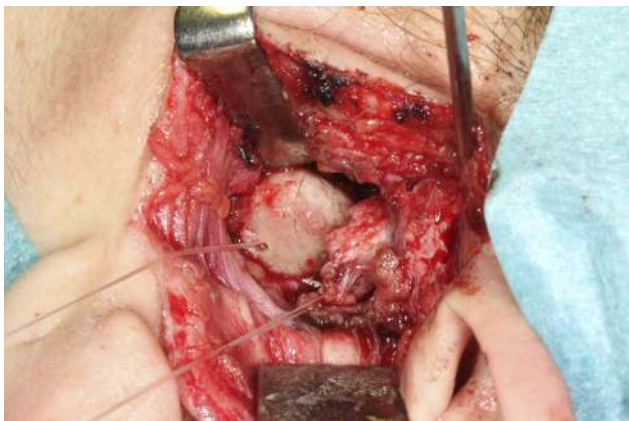
Figure 3 Temporomandibular joint disk repositioning with Mitek anchor.

Partial and total discectomy have been described in the literature. 117 The condyle can be conservatively recontoured to remove any irregularities or osteophytes. After a discectomy, some masticatory muscle and joint tenderness can be expected for a variable period from several weeks to months. Postdiscectomy physical therapy is essential because the therapy helps the patient reestablish an adequate range of motion, among other benefits.