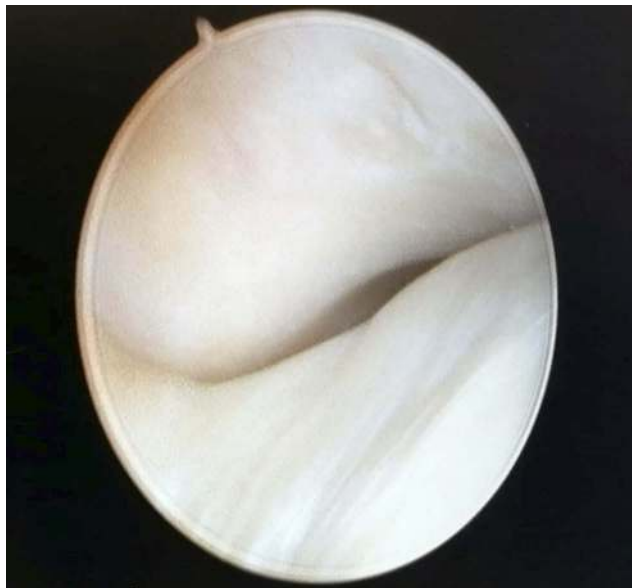
Figure 2 TMJ arthroscopy, superior space.

When the examination of the glenoid fossa is complete, the arthroscope should be directed to explore the joint disc. Disc mobility is observed by maintaining the arthroscope