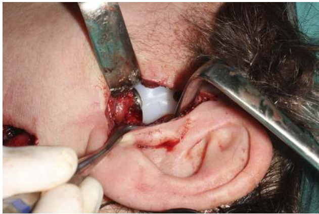
Figure 5 Intraoperative view of TMJ prosthesis.

function and form. 119 The TMJ is essential to the functions of mastication, speech, airway support and deglutition.