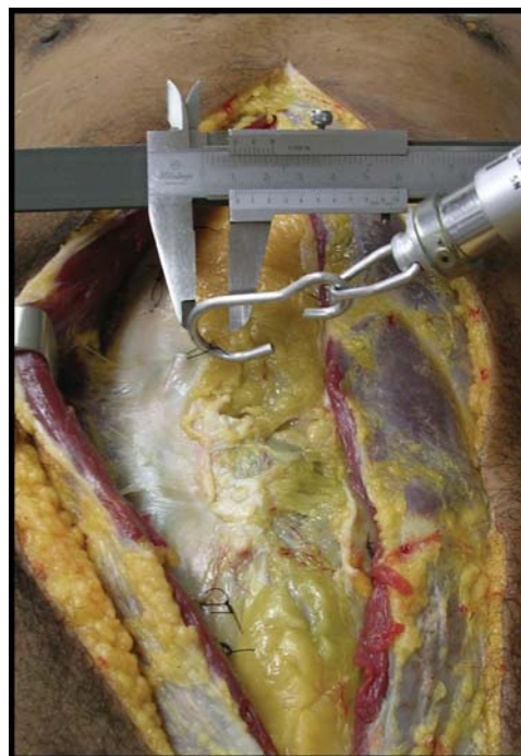
FIGURE 2 - Photograph illustrating the use of the dynamometer and the analogical paquimeter