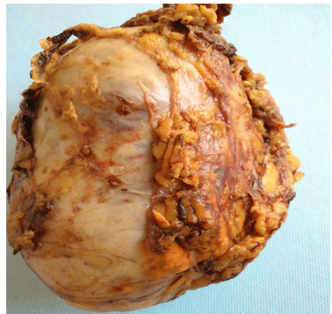
Figure 3 Gross appearance of left adrenal gland, measuring 7 × 10 × 7 cm.

Our patient is doing well with no recurrence of disease on follow-up.