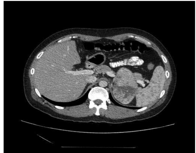
Figure 2 CT thorax, abdomen and pelvis showing left adrenal lesion, measuring 7 × 10 × 7 cm.

well to this. He was treated with low-dose steroids for sarcoidosis, which became quiescent, with normal lung function and imaging (resolution of lymphadenopathy and testicular swelling) on follow-up.