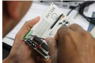
Figure 1. User making a Bee Lab kit during a workshop

and feeder is particularly important during winter months when opening a hive can be detrimental [11].