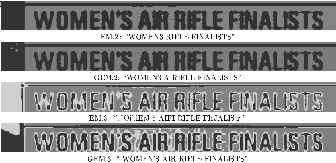
FIG. 3 –. Noise adaptive: Segmentation output of the present 2 algorithms and recognition results using 2 and 3 Gaussians.