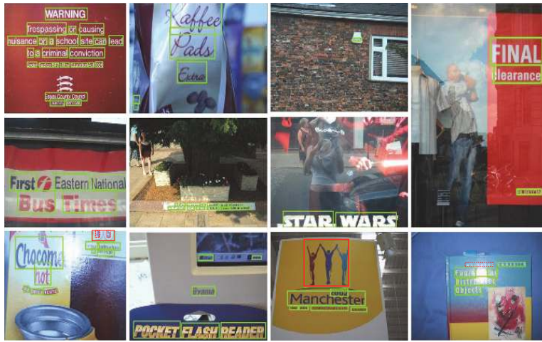
Figure 3: Examples of text localization results. The green bounding boxes are correct detections; Red boxes are false positives; Red dashed boxes are false negatives.