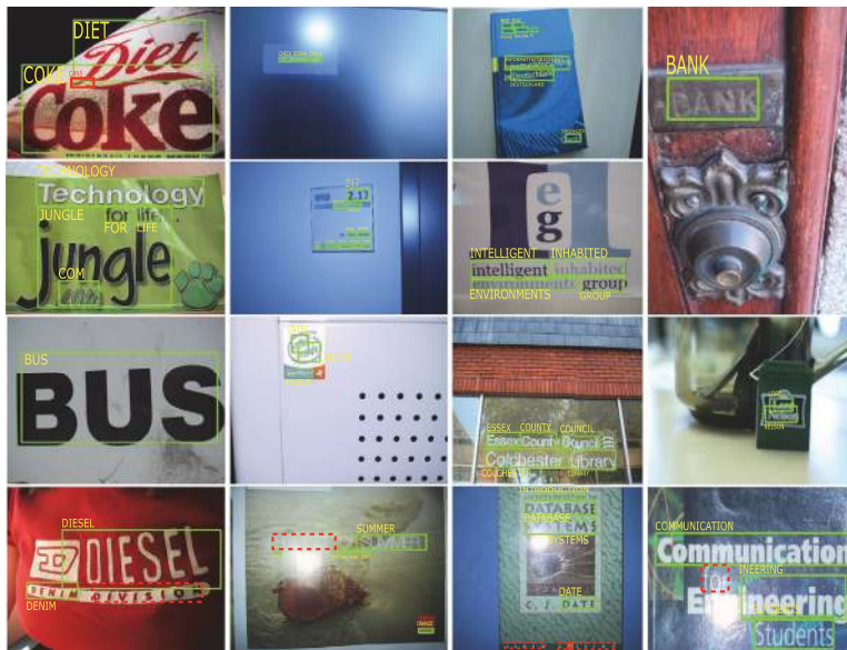
Figure 4: Examples of word spotting results. Yellow words are recognition results. Words less than 3 letters are ignored, following the evaluation protocol. The box colors have the same meaning as Fig. 3.

tion benchmarks. On ICDAR 2013, TextBoxes breaks the records recently made by Adelaide.ConvLSTMs* on all the lexicon settings. More specifically, TextBoxes generates about 35 proposals per image when using multi-scale inputs on ICDAR 2013, with a recall of 0.93. With a strong lexicon for the recognition model, 3.8 bounding boxes per image are reserved, achieving a recall of 0.91 and a precision of 0.97. We employ a 90k-lexicon for SVT and ICDAR 2011, and a 50-word lexicon per image on SVT-50. Note that even though Jaderberg (Jaderberg et al. 2016) and FCRRN+filters (Gupta, Vedaldi, and Zisserman 2016) adopt a much smaller lexicon(50k words), their results are still inferior to our method.