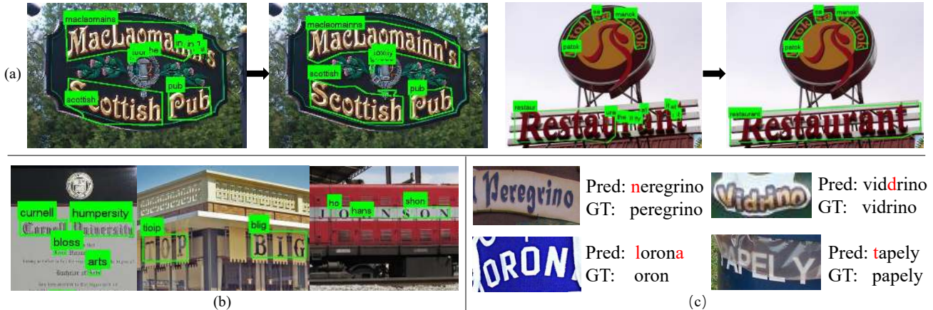
Figure 4: (a) Examples of Mask TextSpotter V3 [30] improvement on Total Text after fine-tuning on TextOCR compared to official weights; (b) Failure cases by MTS V3 on TextOCR test set; (c) Failure cases by Baek et al. [1] on TextOCR test set