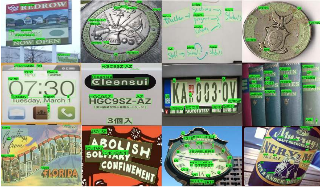
Figure 2: TextOCR visualizations. The figure shows diversity and density in TextOCR images. 1

lenge not releasing the labels and being multi-lingual, the amount of data distributed in each language is smaller.