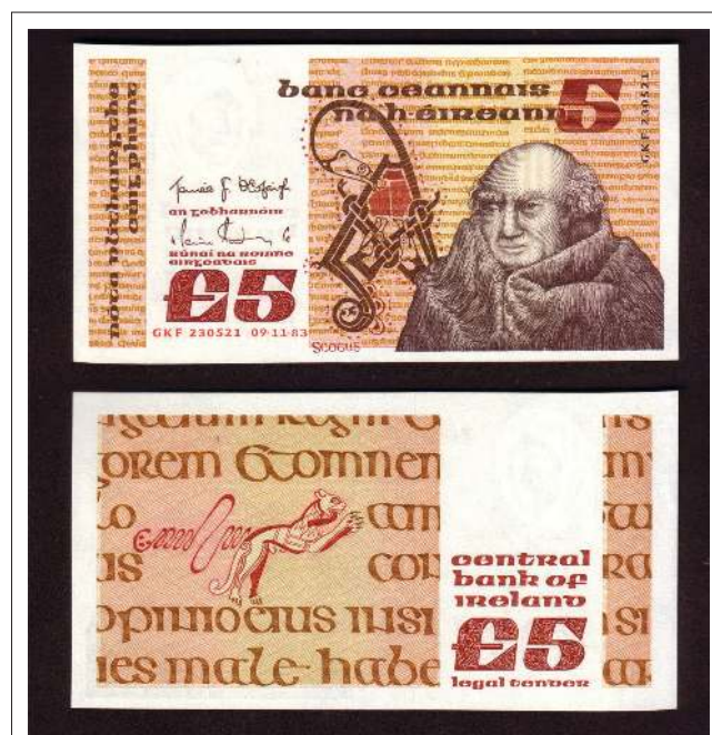
FIGURE 1: Scotus, Central Bank of Ireland's £5, in use from 1976 to 1993. 12

paintings of Eriugena were produced after 1225, graphics from the first copies of manuscripts of the Periphyseon were recreated, resulting in a single, relatively realistic facial image of Eriugena, which was printed on the Central Bank of Ireland's £5 note, in use up to 1993 (Figure 1). Featuring the single word Scotus ('from Ireland'), this creative neo-reception took care that a name not mentioned, a face not seen and a voice not heard for centuries could become visible and audible in Ireland and beyond.