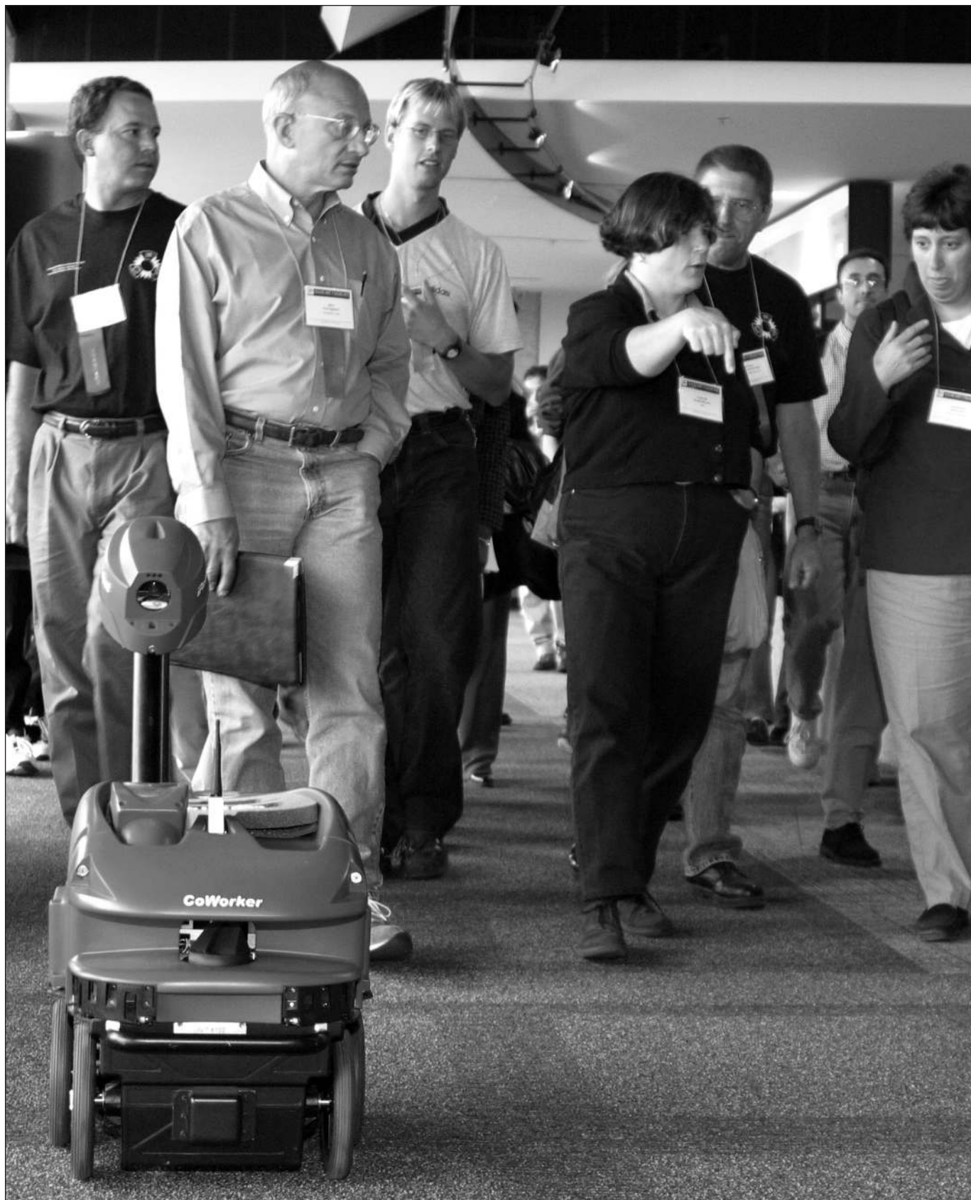
Figure 1. IRobot: CoWorker in Edmonton Alberta's Shaw Conference Centre, AAAI-02.