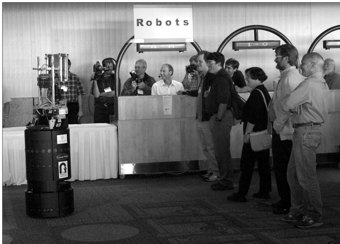
Figure 3. GRACE Approaching the AAI-02 Registration Desk.

the judges were told that the language understanding component worked correctly, once the speech input had been captured. Unfortunately, the failure of the front end made the language understanding difficult to see. Two gesture-recognition methods were planned, one using vision and one using Palm Pilot input, but neither was in working order during the Challenge itself, so they were not successfully demonstrated.