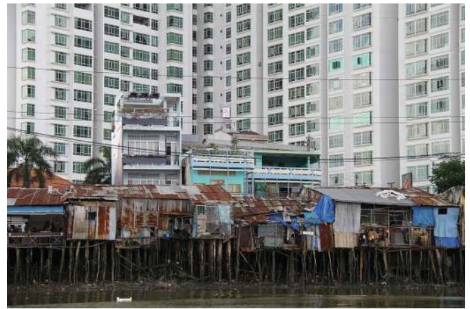
Fig. 3 | Stilt houses on a river bank in Ho Chi Minh City, Vietnam. This flood-mitigation measure is widely applied by the poorest, most exposed and most vulnerable part of the population and stands in stark contrast to the new high-rise residential apartments in the background.

Technological limits. There are no technological limits to these adaptation measures. Some challenges relate to the availability of adequate sand volumes for nourishment 31 , because the sand used