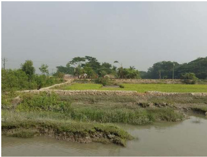
Fig. 2 | Polder system in coastal Bangladesh south of Khulia. Polders are low-lying tracts of land enclosed by dikes, which are widespread in densely populated deltas with the main goal of promoting agriculture. The polder dikes and drains will require substantial upgrades to remain effective under SLR.

the options mentioned above are expected to have benefits exceeding their costs, although it is hard to find detailed analyses demonstrating this.