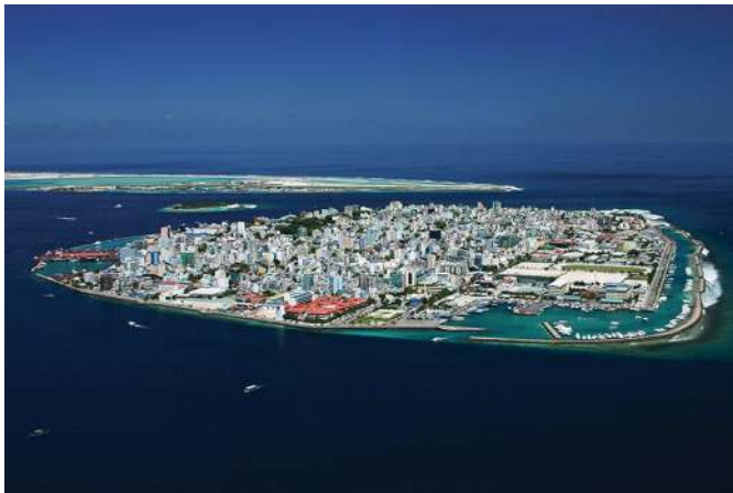
Fig. 4 | Malé, the capital island of The Maldives. High and increasing population densities in Malé have led to the reclamation of the nearby island of Hulhumalé, which can be seen in the background of the photo.

Finance barriers. Island construction was financed by the Government of the Maldives and a concessional loan from the Saudi Fund for Development 47 . Land reclamation is generally attractive for investors, because investments can be paid back in the short term through real-estate revenues generated on the newly created land. In addition, the Maldivian economy has been attractive for investors because it has been growing at an average rate of 7.4% over the last 30 years 48 .