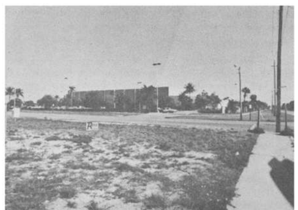
Figure 2. Sample of photographs taken at Location C (top pair) and Location D (bottom pair).