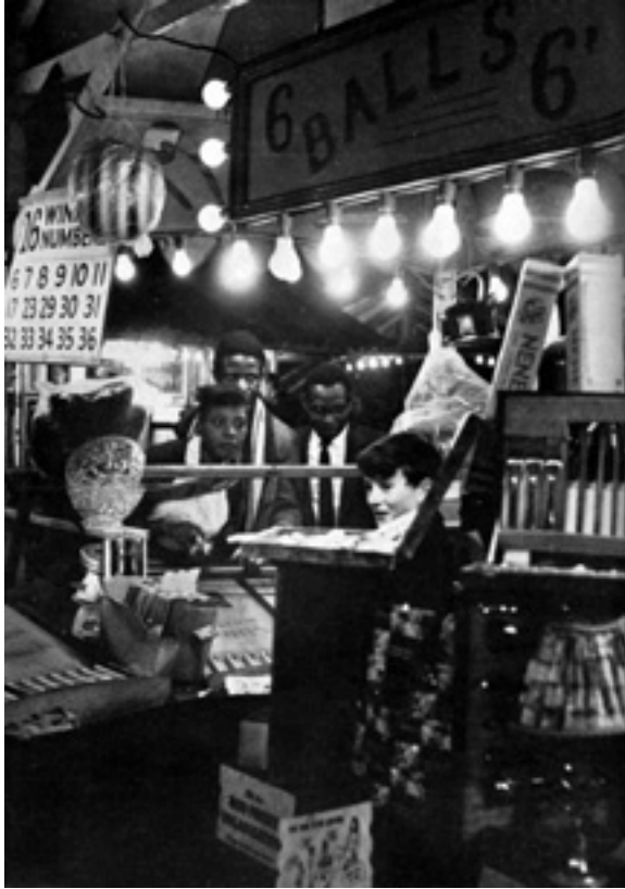
Figure 14. Tom Picton's 1961 photo-essay for the West African Review , "Oh, Mary, This London," showed a student enjoying some of London's charms. ( West African Review 32 [August 1961]: 4-11)

cation. These images were at odds with the Review's glamour shots of students just a few years before.