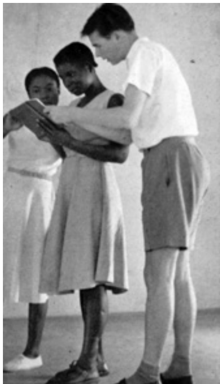
Figure 3. VSOs rehearsing a Chekhov production in Ghana.