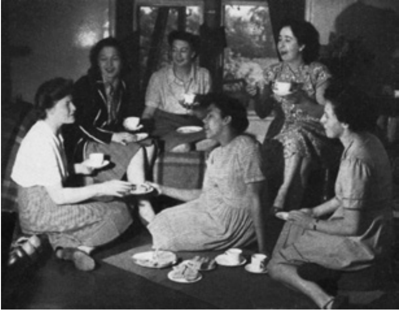
Figure 18. Stuart was also shown giving a tea party for her white classmates. The caption read, "I say, girls, aren't these muffins simply scrumptious?" ( West African Review 18 [December 1947]: 1283)

African women undertook their own courses of study in Britain (figures 17 and 18). 16 The West African Review published advice from "Jennifer," an eighteen-year-old at Oxford, who instructed her compatriots to invest in a stylish camel coat, expensive woolen underclothes, and a coffee percolator for their student days in Britain. 17