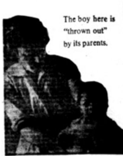
Figure 26. "Nigerian Babies 'Banished' by Parents in UK." This picture accompanied an article in the West African Pilot lamenting that Nigerian babies were being "banished" by their biological parents. ( West African Pilot , April 11, 1959, p. 2)

drafted a booklet on private fostering specifically for West African parents. Here, the transcultural psychiatrist Robbina Addis emphasized the emotional risks of fostering: "a child is best looked after by his own mother." 152 She concluded that it was preferable to leave children with relatives in Africa than to foster them in Britain. The National Committee for Commonwealth Immigrants (NCCI) described Addis's pamphlet as "very perturbing," because "it was most invidious for the government to suggest that families should be split up." 153 Although African student families were likely to be divided either through private fostering with white families in Britain or through kinship fostering in Africa, the NCCI believed that the impetus for fracturing African families should never come from the British state.