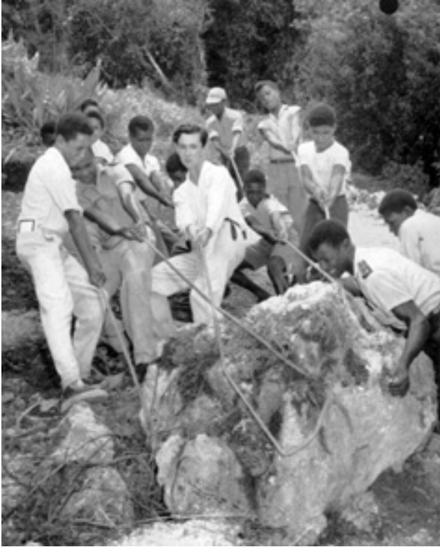
Figure 4. VSOs helping to build a community center in Jamaica.

The largest group of volunteers worked in Nigeria, but the sites of service quickly diversified even beyond the confines of the former empire, thus striving to ensure that Britain's role in the new world order would not be delimited by the imperial past.