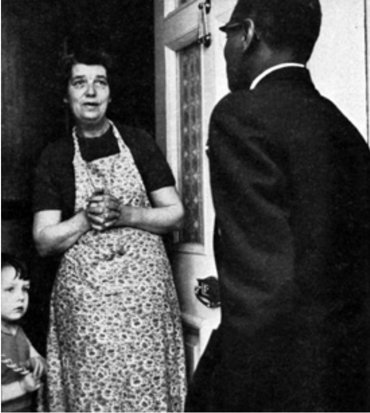
Figure 15. Picton also documented the “fading of the rosy dream,” as the student negotiated with white landladies, and encountered isolation and racism. ( West African Review 32 [August 1961]: 4–11)