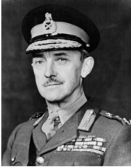
Figure 6. Sir Gerald Templer.

is the rapidity with which this victor of the early days of decolonization came to seem entirely out of date. Some forms of expertise had expired with independence.