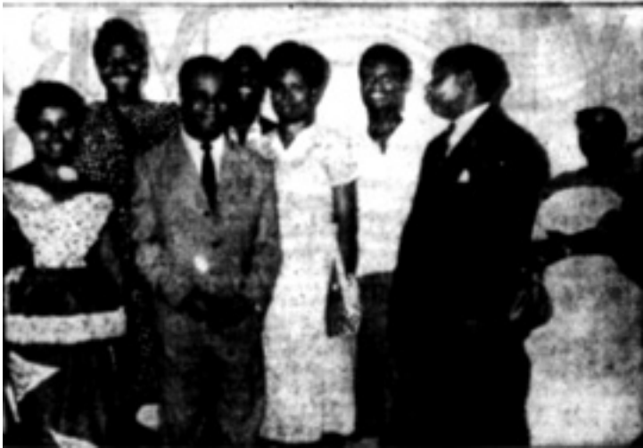
Figure 8 (top). "In Quest of 'Golden Fleece.'" This photograph celebrated Nigerians who were about to pursue studies in the United Kingdom. ( West African Pilot , October 8, 1959, p. 3)

Figure 9 (bottom). "They Return with 'Golden Fleece.'" Other students were welcomed back when their degrees were completed. ( West African Pilot , June 24, 1960, p. 3)