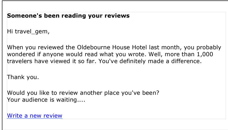
Figure 2: Email from TripAdvisor regarding Member Update