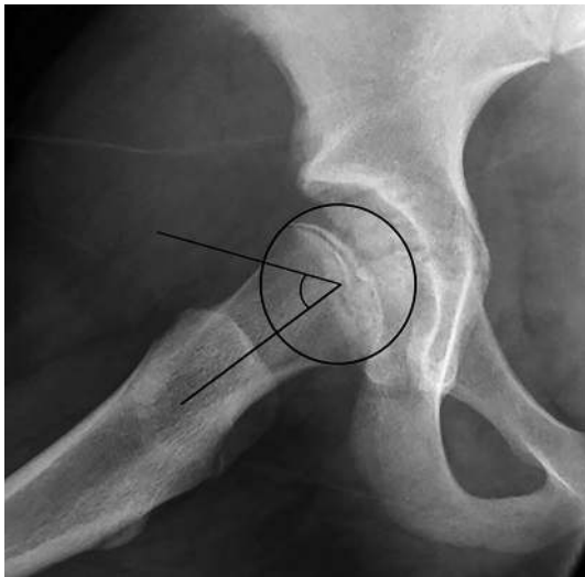
Fig. 1 Frog-leg lateral radiograph of the asymptomatic right hip of an 11-year-old female presenting with left SCFE, demonstrating an alpha angle of 54^\circ . The alpha angle is measured by placing a perfect circle over the femoral head and measuring the angle formed between a line from the center of the femoral head to the center of the femoral neck and a second line from the center of the femoral head to the point at which the anterior femoral neck leaves the perfect circle