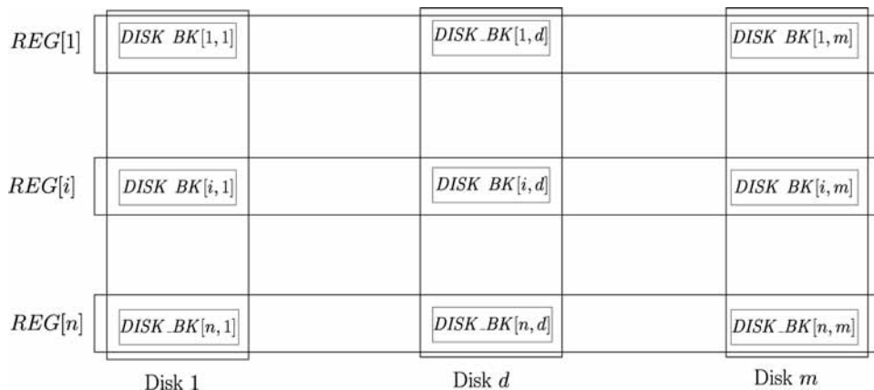
FIGURE 4. Replicating and distributing REG[1..n] on the m disks.

can only start with the invocation I that has written v in the corresponding register. It follows that v' = v .