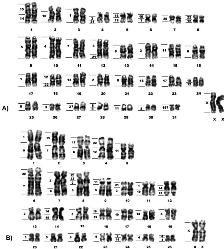
Figure 2. G-Banded Karyotypes of Female Nine-Banded Armadillo and Female Lesser Anteater

(A) Female nine-banded armadillo D. novemcinctus ( 2n = 64 ) and (B) female lesser anteater T. tetradactyla ( 2n = 54 ).