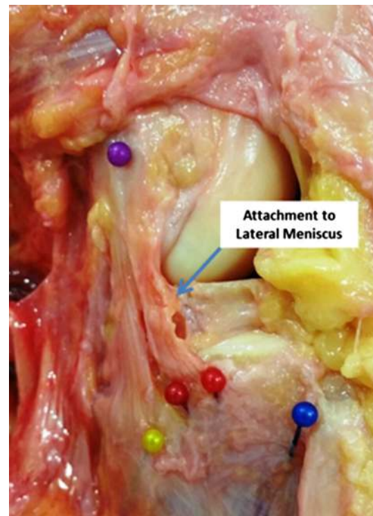
Fig. 3 Photograph demonstrating attachment of the dissected ALL to the lateral meniscus

The mean dimensions were: length 40.1 ( \pm 5.53 ) mm, width 4.63 ( \pm 1.39 ) mm, thickness 0.87 ( \pm 0.18 ) mm. The femoral origin was posterior and proximal to the lateral collateral ligament attachment in six knees, anterior and distal in three knees, and at the same site in one knee. The tibial attachment was found to be a mean 17.7 ( \pm 2.95 ) mm from the GT and 12.3 ( \pm 3.55 ) mm from the FH. This was 59.5 ( \pm 5.44 ) % from GT to FH.