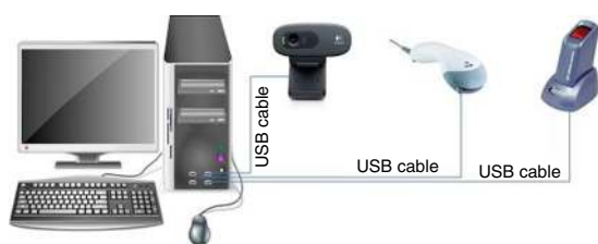
Fig. 3. Setup for the computers, with peripheral devices. This setup is typical of computers at the health facilities. Each of the peripheral devices was connected to the computer system’s unit via a USB cable. The device to the extreme right of the diagram is the fingerprint detector. Next to the fingerprint detector is a barcode reader for scanning identification cards with barcodes. The last device (black) is a web camera.

residence population. In addition, a license key was purchased to activate the fingerprint scanning device of each computer and a server was purchased to store backups. One box of tools and other accessories were procured for the maintenance and repair of the computers.