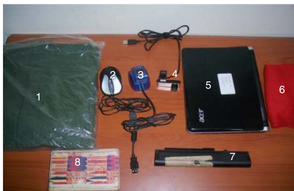
Fig. 2. Computer hardware and logistics: (1) the raincoats; (2) the mouse; (3) the biometric fingerprint devices; (4) the web cameras; (5) the mini-laptops; (6) the red calico used for the background of the photos taken; (7) the spare batteries for the mini-laptops; and (8) the field notebooks used.