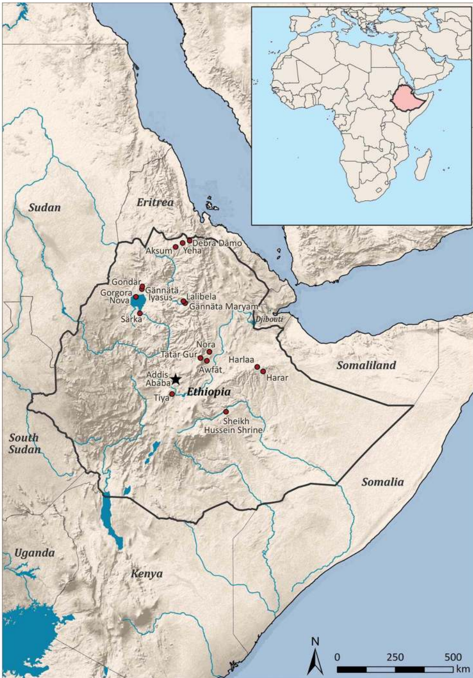
Figure 1. Map of the main sites mentioned in the text (map by N. Khalaf).

a lesser extent its late Classical archaeology, are much less well known than the prehistory of the country. It is this medieval period that forms the focus of the present article and of the special section that it introduces.