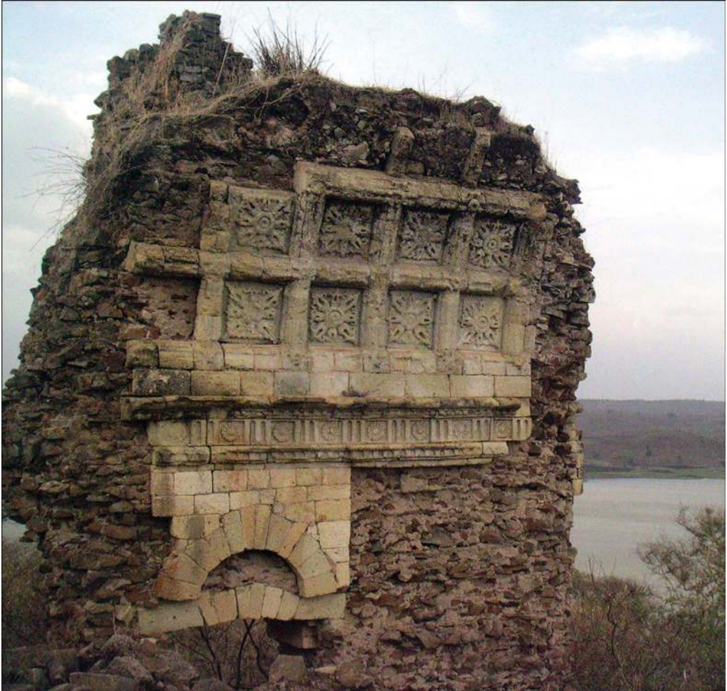
Figure 5. Church roof vault at Gorgora Nova, since collapsed.

(Joussaume 1995: 102–103, 2007; Derara 2011). At Tiya, 50km south of Addis Ababa (Figure 1), many of the rhyolite 2–5m-high standing stones were carved with sword blade or lance-head symbols, or with ‘Y’-shapes that might depict genitalia or scarification marks (Derara 2011: 72; Insoll 2015: 173; Figure 6). These stones are possibly from the thirteenth to fourteenth centuries, based on dates from an associated cemetery (Joussaume 1995: 148–52 & 286). This megalithic diversity and the practices that they represent lasted until the fifteenth century, when they disappeared, perhaps due to population displacement following the migration of the Oromo ethno-linguistic group into parts of Ethiopia (Finneran 2007: 248).