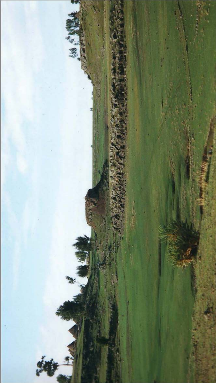
Figure 4. Amba Māryām, Mesāla Māryām (photograph by M.-L. Derat, Mission Mesāla Māryām, 1997).