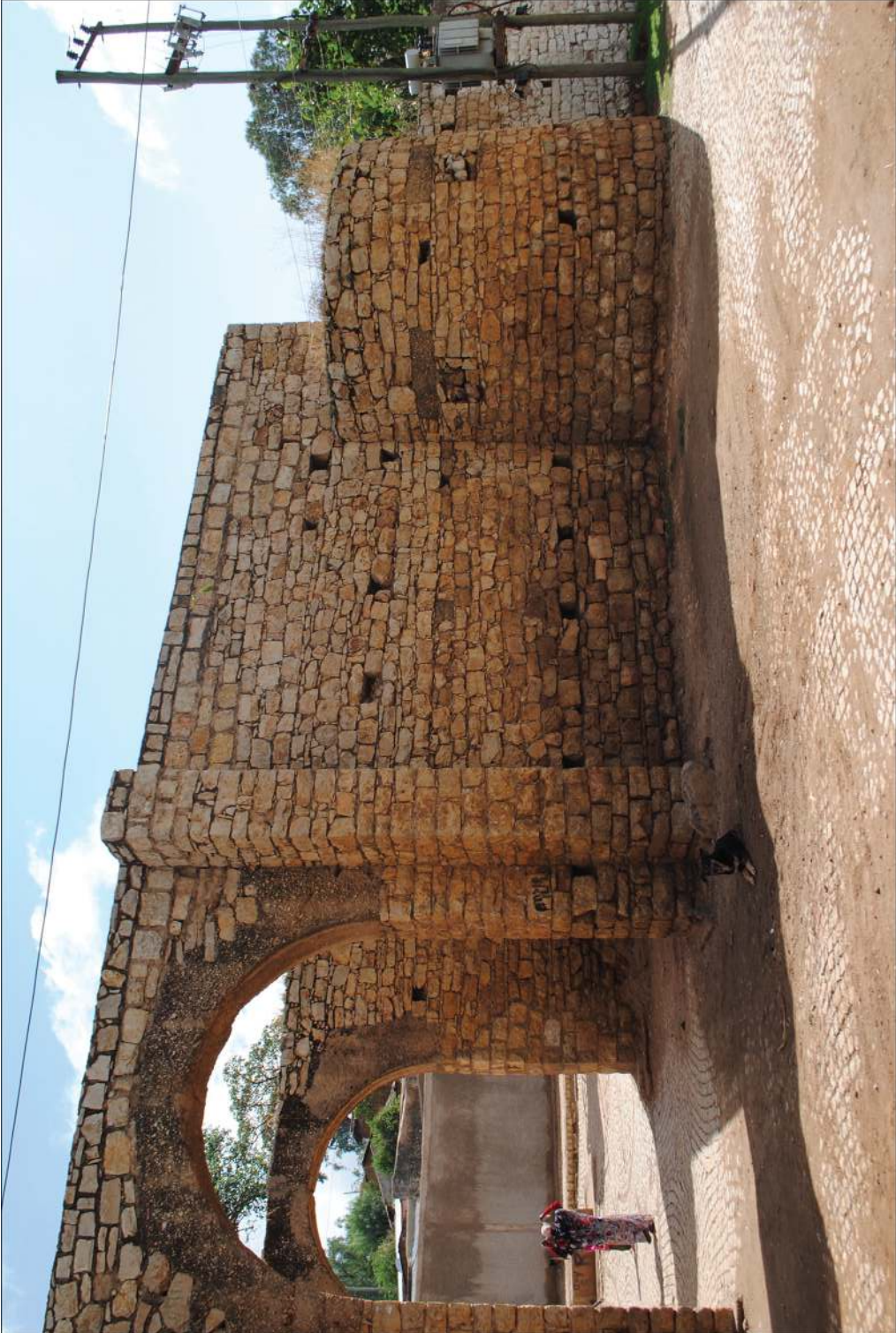
Figure 2. Badri Bari, one of the five original gates in the Harar djugel (city wall).