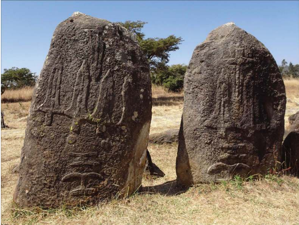
Figure 6. Standing stones at Tiya featuring carvings of with sword blades or lance-heads and 'Y'-shapes.

origins of the site have also been challenged through the identification of what is referred to as a 'troglydic' culture, manifest also at Washa Mika'el, where pre-Christian iconography and space was appropriated and transformed to create the extant church (Derat et al. 2021). In the western Ethiopian borderlands, 'vernacular cosmopolitanism' (González-Ruibal 2021) was evident, with awareness of other religious systems, material worlds and cultural traditions, but within a framework of marginality, and one that changed over time. In medieval Harlaa, multiple strands contributed to a cosmopolitan urban culture, with Islamic heterogeneity apparent and religious plurality probable. Furthermore, trade and other networks extended far beyond eastern Ethiopia, both directly and indirectly incorporating people, ideas and trade goods (Insoll et al. 2021). In eastern Tigray, excavation of an Islamic cemetery has revealed the deep roots of a Muslim community within the Christian highlands, commencing in the late tenth century and continuing for 300 years, attesting both toleration and co-existence. Moreover, the community used iconographic traditions, suggesting widespread connections (Loiseau et al. 2021).