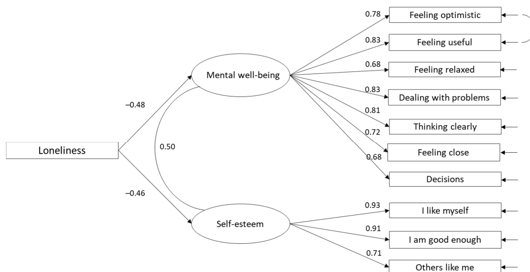
Figure 1. Perceived loneliness as a predictor for low mental well-being and low self-esteem ( n = 5751 ). Standardized beta coefficient reported. All estimated parameters were statistically significant at level p < 0.001 .

To answer our research question, to what extent does loneliness explains variance in positive mental well-being and self-esteem, we estimated the regression coefficients from loneliness to two latent factors: mental well-being (‘feeling optimistic’, ‘feeling useful’, ‘feeling relaxed’, ‘dealing well with problems’, ‘thinking clearly’, ‘feeling close’, ‘being able to make up my own mind’) and self-esteem (I like myself, I am good enough, others like me). The covariance between ‘feeling optimistic’ and ‘feeling useful’ was also estimated in the final model based on high modification indices (Figure 1). The fit indices showed good fit for the model in which the regression coefficients were added from loneliness to mental wellbeing and self-esteem: \chi^2(41) = 510.80, p < 0.001 ; CFI = 0.98, TLI = 0.97, RMSEA = 0.05, SRMR = 0.03. All items measuring mental wellbeing and self-esteem had high factor loadings varying from 0.69 to 0.93. The regression coefficient between loneliness and mental well-being was -0.48 (p < 0.001) , and between loneliness and self-esteem -0.46 (p < 0.001) , indicating that loneliness is a significant risk factor for mental well-being and self-esteem among adolescents in Nordic countries. Loneliness explained 23% of the variance in mental wellbeing and 21% of the variance in self-esteem. All estimated parameters were statistically significant at level p < 0.001 and are presented in Figure 1.