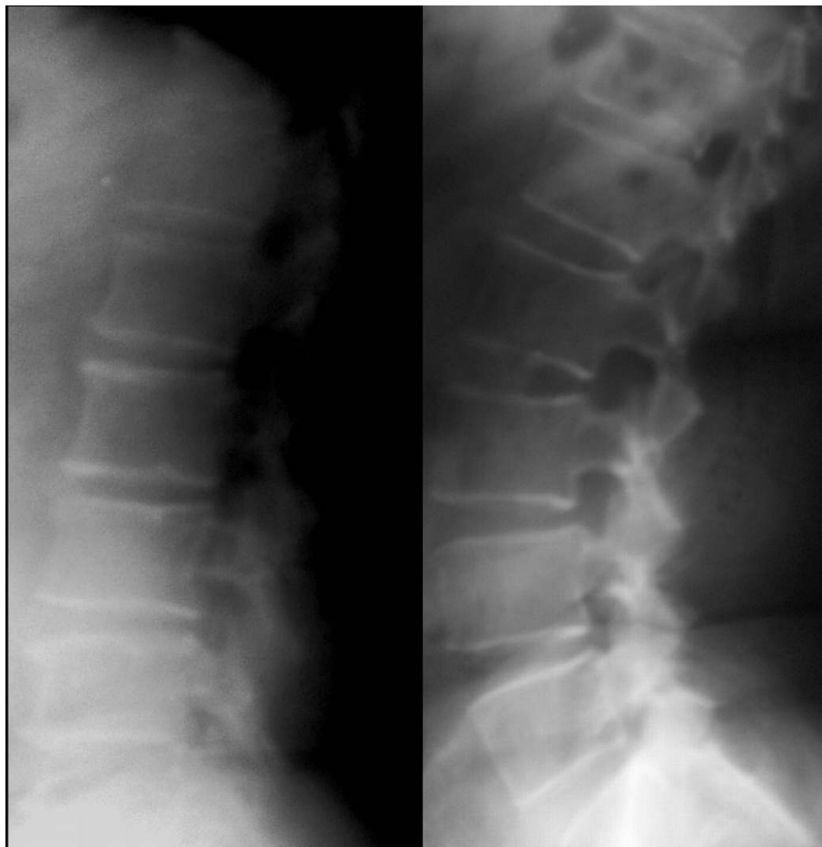
Figure 3 Left: OA patient with minimal lordosis; L 1 - L 5 6°, L 1 - S 1 28°, L 5 - S 1 21°. Right: OA patient with exaggerated lordosis; L 1 - L 5 51°, L 1 - S 1 70°, L 5 - S 1 19°.

The lack of statistically significant differences in our study can be partly explained by the fact that each person has a unique posture and spinal curvature. What constitutes deviation from the correct alignment and abnormal loading, that could induce degenerative changes on the lower spine, is probably a personalized characteristic. In a similar rationale, lumbar lordosis has a wide range of