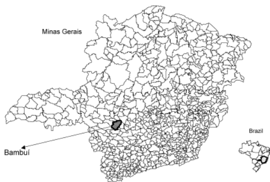
Figure 1 - Geographical localization of Bambuí in the State of Minas Gerais, Brazil.

The methodology of a population based cohort study of the elderly in Brazil and preliminary descriptive results of the baseline survey were presented. The investigation is being carried out in a town of 15,000 inhabitants in the State of Minas Gerais. The main objective of the present study is to identify predictors of mortality, hospitalisation and physical and cognitive deficits in the population aged 60 and over. A secondary objective is to describe the baseline health and social conditions of this population and to compare them with those of younger residents in the town.