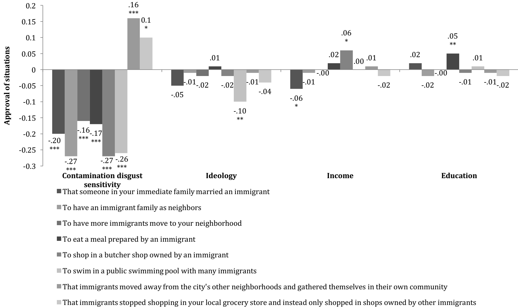
Figure 2. Effects of Contamination Disgust Sensitivity, Ideology, Income, and Education on Approval of Situations Involving Increased or Decreased Contact with Immigrants

Note: Entries are unstandardized OLS regression coefficients. All variables range 0-1. The effects are controlled for gender, age, opposition to immigration and the other variables in the figure. * p < .05 ** p < 0.01 , *** p < 0.001 , one-sided tests.