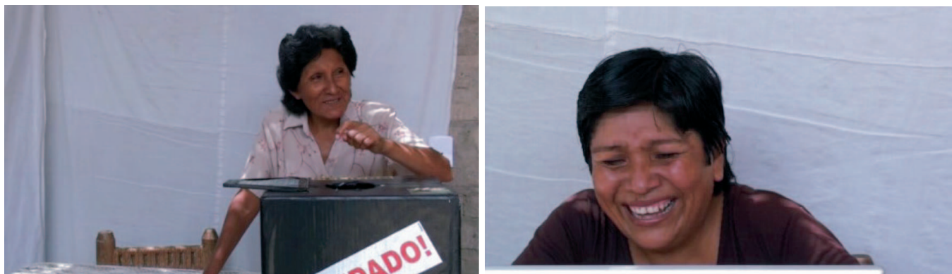
Fig. 2. Set 3 Participant PF01 Fear and Participant PF02 Amused

(available for download with the database). Details of the results for the self-reported emotion and intensities are available for each recording. Additionally a further questionnaire attempted to address the issue of exposure to other cultures and people from other cultures, asking people to assess the amount of time they have spent interacting with people from various parts of the world and their exposure to television and films from the same parts of the world. The details will be available for each recording.