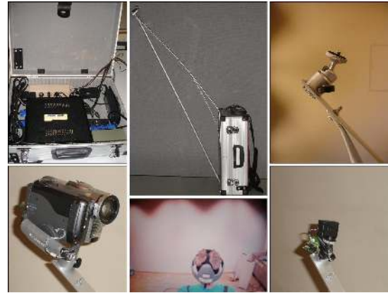
Figure 1. Description of the used hardware and screenshot.

To perform these experiments we first wanted to use the digital camera Canon MVX45i. But it was too heavy and led to "balance effects". Moreover, due to its weight, we were not able to fix it on the HMD in front of the head. We finally decided to work with a radio color mini-spycam (wide-field of view) providing a video flow in PAL format (450 lines). It only weights a few grams and can thus be easily fixed on the HMD.