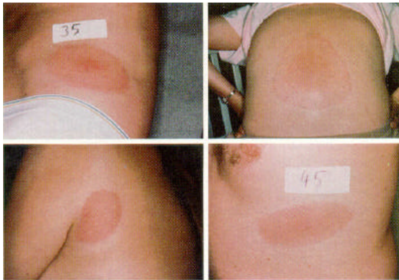
Figure 1. Erythema migrans of the skin of patients at the Lyme Disease diagnostic Center, Westchester County Medical Center, New York

114. Supported by National Institutes of Health grants A129731, A124424 (A.G.B.), and A128956 (D.F.); Centers for Disease Control Contract U50/CCU20662601 (D.F.); USDA grant 58-1265-2119 (D.F.); and grants from the Lyme Borreliosis Foundation (A.G.B.), American Lyme Disease Foundation, and G. Harold and Leila Y. Mathers Charitable Foundation (D.F.).