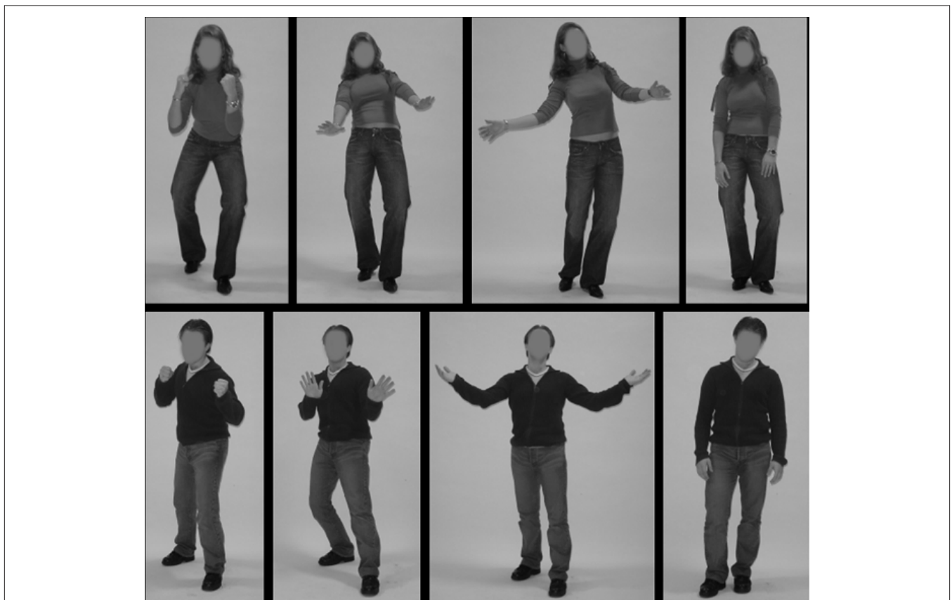
FIGURE 1 | Examples of edited stimuli showing a female (top row) and male (bottom row) actor. The expressions display (from left to right): anger, fear, happiness, sadness.

Nineteen participants [11 female, mean (std) age: 22.5 (2.4)] took part in the validation experiment in exchange for course credits. All 254 stimuli were randomly presented one by one for 4000 ms with a 4000-ms inter-stimulus interval during which a blank screen was presented. The participants were instructed to categorize the emotion expressed in the whole body stimulus on an answering sheet in a four alternative-forced-choice task (anger, fear, happiness, sadness).