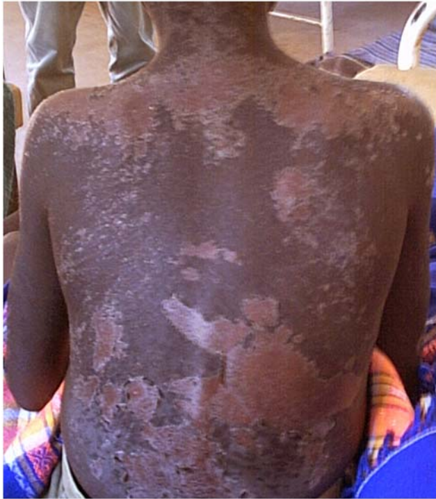
Figure 2. Child with Resolved Exfoliative Dermatitis (Epidermal Necrolysis) Resulting from Early Stage T.b. rhodesiense HAT Treatment with Suramin. The acute stage of this condition presents with blistering and the peeling off of large areas of skin; complications due to secondary infection are likely. doi:10.1371/journal.pntd.0000333.g002