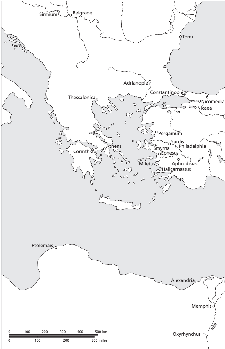
Map 1 The Byzantine Empire, c. 500