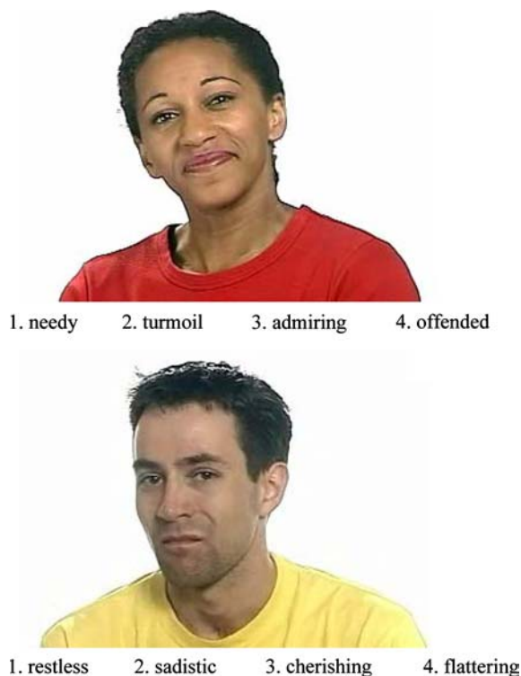
Fig. 2. Examples of questions from the emotion recognition in the face task (showing only one frame out of the full clip).

In both tasks four adjectives, numbered from 1 to 4, were presented after playing each stimulus. Participants were asked to press 1, 2, 3 or 4 on a keyboard to select their preferred answer. After choosing an answer the next item was presented. No feedback was given during the task. A handout of definitions of all the adjectives used in the task was