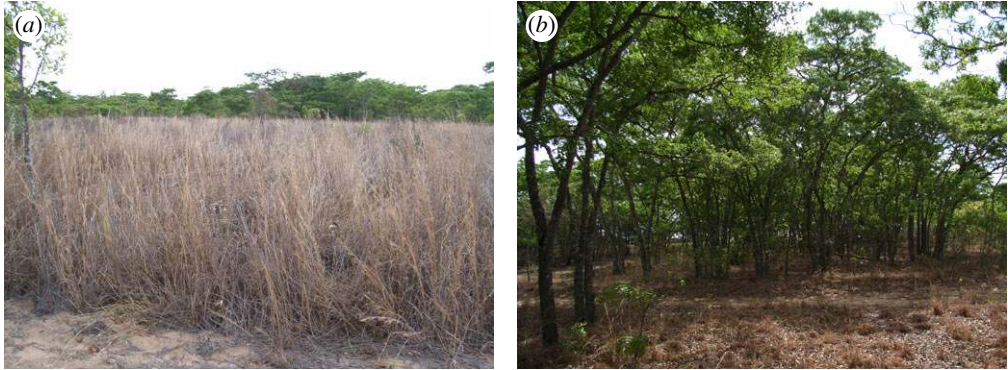
Figure 2. The effect of fire in miombo at Marondera, Zimbabwe. (a) A plot that was burned annually for 50 years. (b) A plot that has been protected from fire during the same period. See Furley [56] for further details. (Online version in colour.)