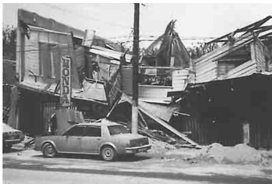
Following Mount Pinatubo's cataclysmic June 15, 1991, eruption, thousands of roofs collapsed under the weight of ash made wet by heavy rains (see example in photo above). Ash deposits from the eruption have also been remobilized by monsoon and typhoon rains to form giant mudflows of volcanic materials (lahars), which have caused more destruction than the eruption itself (photo at right shows village buried by lahars).

When even more highly gas charged magma reached Pinatubo's surface on June 15, the volcano exploded in a cataclysmic eruption that ejected more than 1 cubic mile (5 cubic kilometers) of material. The ash cloud from this climactic eruption rose 22 miles (35 kilometers) into the air. At lower altitudes, the ash was blown in all directions by the intense cyclonic winds of a coincidentally occurring typhoon, and winds at higher altitudes blew the ash southwestward. A blanket of