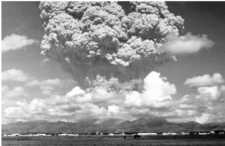
A huge cloud of volcanic ash and gas rises above Mount Pinatubo, Philippines, on June 12, 1991. Three days later, the volcano exploded in the second-largest volcanic eruption on Earth in this century. Timely forecasts of this eruption by scientists from the Philippine Institute of Volcanology and Seismology and the U.S. Geological Survey enabled people living near the volcano to evacuate to safer distances, saving at least 5,000 lives.

On July 16, 1990, a magnitude 7.8 earthquake (comparable in size to the great 1906 San Francisco, California, earthquake) struck about 60 miles (100 kilometers) northeast of Mount Pinatubo on the island of Luzon in the Philippines, shaking and squeezing the Earth's crust beneath the volcano. At Mount Pinatubo, this major earthquake caused a landslide, some local earthquakes, and a short-lived increase in steam emissions from a preexisting geothermal area, but otherwise the volcano seemed to be continuing its 500-year-old slumber un-