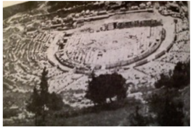
The theatre of Dionysos, constructed in 330 B.C (Jordan, 1969)

Such seminal examples abound in the history of architecture but to mention them is beyond the scope of this paper. We could not but notice that the round shape, as well as the square shape, had a leading position forming for many scientists a basic problem as to how to combine them.