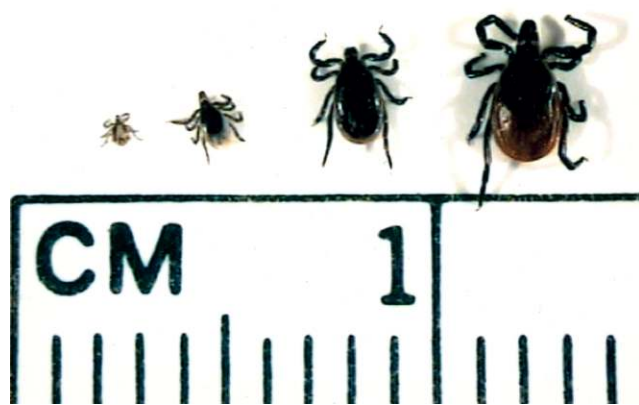
Figure 1. From left to right, an Ixodes scapularis larva, nymph, adult male tick, and adult female tick.

1 month after removing an attached tick should promptly seek medical attention to assess the possibility of having acquired a tickborne infection. HGA and babesiosis should be included in the differential diagnosis of patients who develop fever after an Ixodes tick bite in an area where these infections are endemic (A-II). A history of having received the previously licensed recombinant outer surface protein A (OspA) Lyme disease vaccine preparation should not alter the recommendations above; the same can be said for having had a prior episode of early Lyme disease.