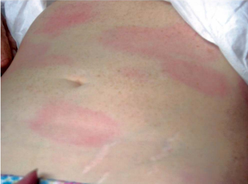
Figure 3. Illustrative examples of culture-confirmed erythema migrans. A , A single erythema migrans lesion of 8.5 \times 5.0 cm on the abdomen. The lesion is homogeneous in color, except for a prominent central punctum (presumed site of preceding tick bite). B , Patient with >40 erythema migrans lesions found. Note the prominent central clearing of the lesions present on the abdomen. Reprinted with permission from [114]. (Copyright 2006, Massachusetts Medical Society. All rights reserved.)