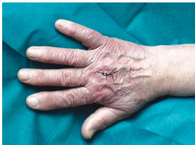
Figure 4. Illustrative example of a patient with acrodermatitis chronica atrophicans.

1. Available data indicate that acrodermatitis chronica atrophicans may be treated with a 21-day course of the same antibiotics (doxycycline [B-II], amoxicillin [B-II], or cefuroxime axetil [B-III]) used to treat patients with erythema migrans (tables 2 and 3). A controlled study is warranted to compare oral with parenteral antibiotic therapy for the treatment of acrodermatitis chronica atrophicans.