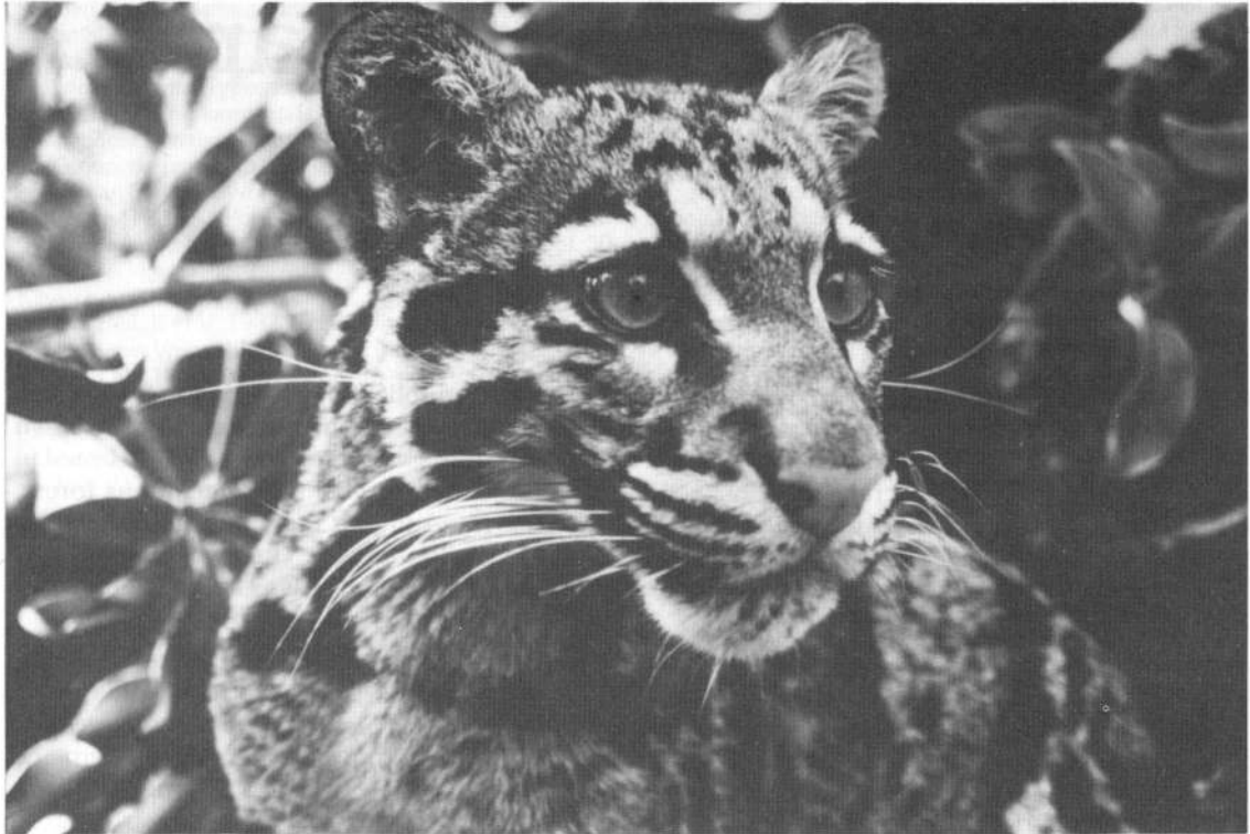
Clouded leopard (Lori Price).

individual, also a male, was stoned to death near the city of Pokhara near the Panchayat Training Centre, retrieved by forestry officials, and placed in the local museum.