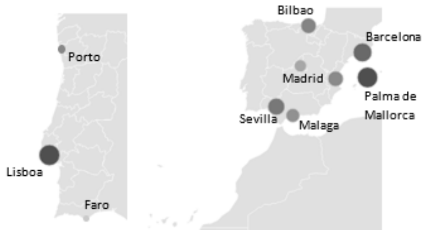
Figure 1: Map of search density for Airbnb in Portuguese and Spanish cities