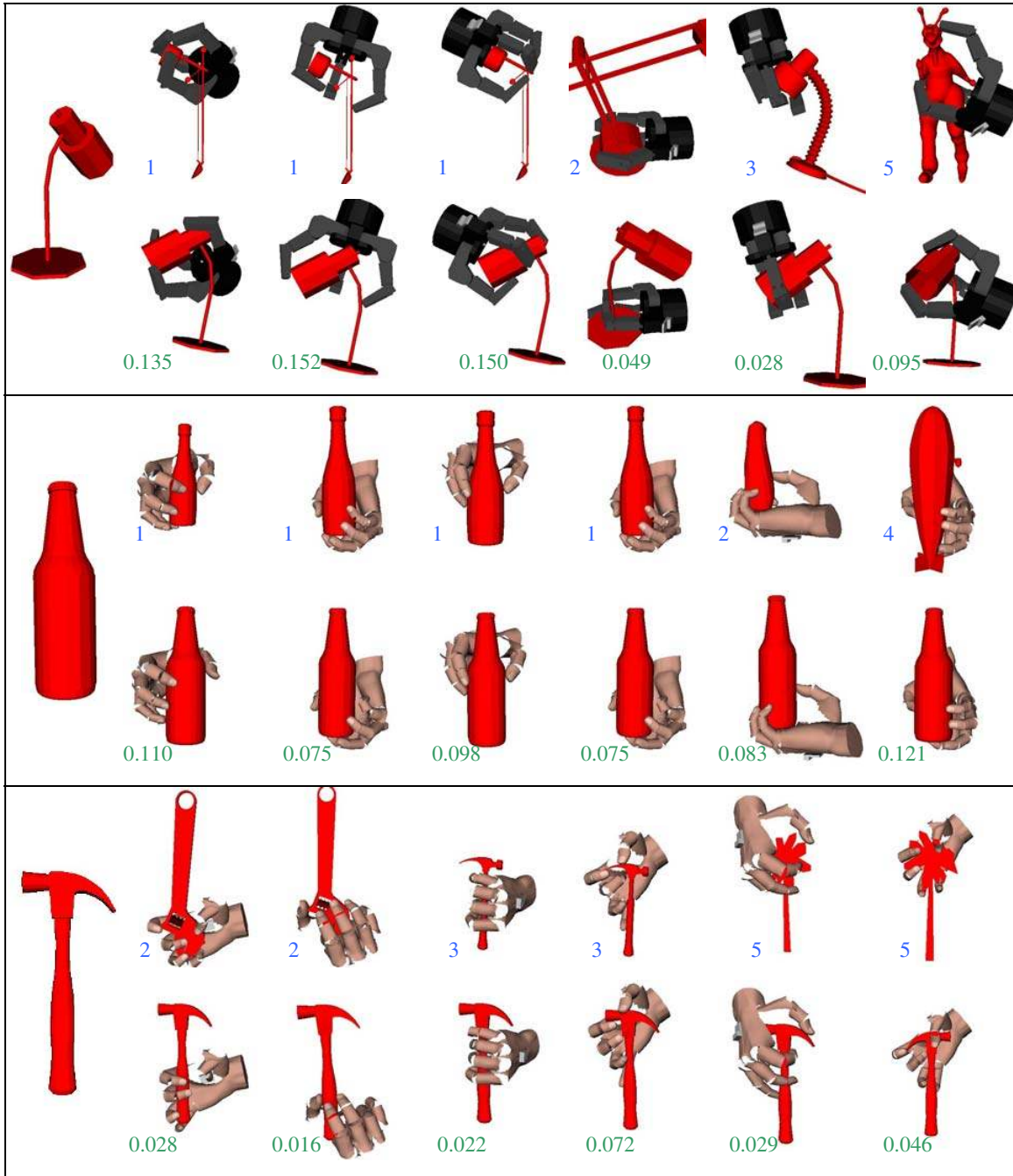
Fig. 1. Three example models and their grasps, using the database-backed planner with Zernike neighbors. For each model \alpha (left), the top row of images shows a neighbor n_k from the database, the value of k , and a pre-computed grasp on that neighbor. Directly below each neighbor is the same grasp executed on \alpha , along with its GWS epsilon quality measure.

For our third method, we randomly selected k models from the database and designated them as ‘ unordered ’ neighbors. We emphasize that these are not random grasps in any sense; \alpha has been translated and axis-aligned with some model of a similar scale. Furthermore, the pre-grasps applied to it are pointed in the right direction, with joint angles drawn from a high quality eigengrasp subspace and known to produce form closure on another model with aligned principal axes. We therefore expect that some of the pregrasps taken from