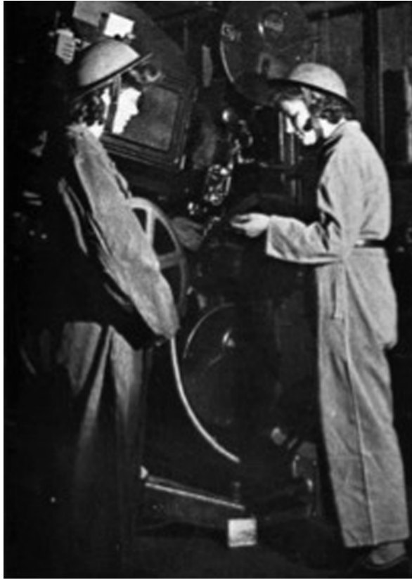
FIGURE 3. Two women operators at the Granada Harrow, London, thread the projector while wearing practical overalls and hard hats.

during wartime, women filmgoers had “to make sense . . . of a range of representations of themselves: from being inessential to national identity, to being central to it, to threatening to it.” 76 This is true of female operators, for while younger women became “central” to cinema’s continuation in wartime, the trade press represented older women as “inessential” or even “threatening” in their perceived ineptitude. Thus there was always an apparent need—whether owing to a lack of training, youth, or older age—for superior male cinema employees to watch over the projectionettes and uphold dominance. Even the complimentary manager at the Manchester Rialto stated that he had “always [felt] a thrill of admiration” when he watched the women projectionists make changeovers. He claimed that