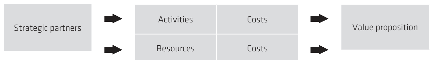
Figure 3: Two pathways to business model scalability

Business model thinking provides us with an alternative to business development, which should be considered by entrepreneurs or company managers. The configurations identified in the literature were found to be mainly related to strategic partners, cost structures, activities, resources and the value proposition of the company and in analysing the business model innovation in patterns one to five that led to exponentially increasing returns to scale, two routes emerged. Depicted in figure 3, we label these the two pathways to business model scalability.