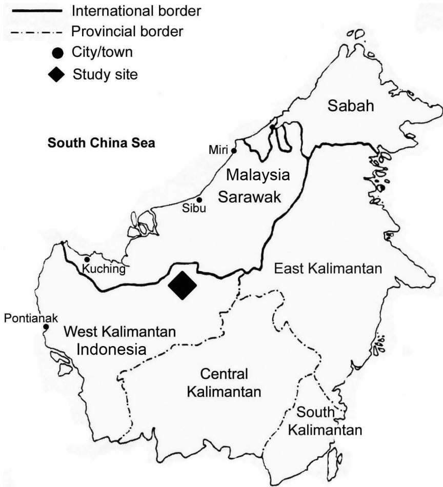
Figure 1. The island of Borneo.

borders are seen as significant areas of research because they provide a unique setting from which to observe the formation of state power and sovereignty. Moreover, a focus on borders is one way of challenging inherent images of the state as a cohesive and unitary whole, an approach that attempts to capture the more intricate ways in which state and society are intertwined in the margins (Donnan 2001, Donnan and Wilson 2010, Zartman 2010). In South East Asia as elsewhere, these studies embrace different attempts to understand the dynamics of state borders, adjoining border regions and their populations from below. Here state borders are not merely lines drawn on maps, not only places where the nation state enforces its outer territorial sovereignty and imposes its strict authority but