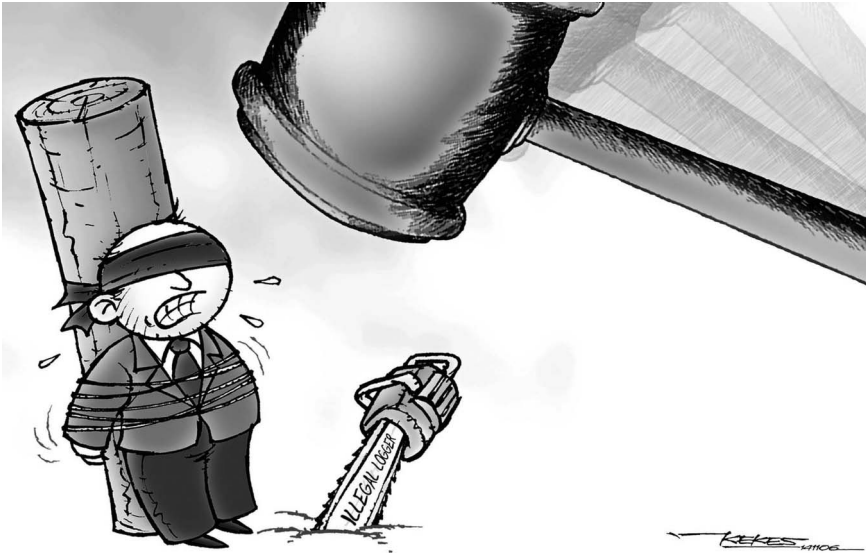
Figure 3. Cartoon in provincial newspaper. Picturing the public demand for tough action taken against the Malaysian timber barons ( cukongs ).

applied to denote illegal practices and people (such as border populations) beyond government reach and control.