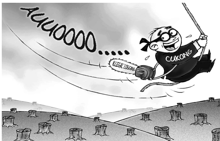
Figure 2. Cartoon in provincial newspaper. Picturing how the Malaysian timber barons ( cukongs ) roamed freely in executing their logging business (Photo courtesy: Pak Kekes, Pontianak Post, 16 September 2006).

In 2004, as a result of central government attempts to regain authority over the lucrative forestry sector and reduce immense public criticism of the national authorities' incompetence in dealing with illegal logging along the border with Malaysia, Indonesian President Susilo Bambang Yudhoyono pledged 'tough action' against illegal loggers throughout Indonesia (Jakarta Post 2004b). This statement was later followed by a presidential decree directed at eradicating all such 'wild logging'. In state rhetoric, the word 'liar' or 'wild' is often