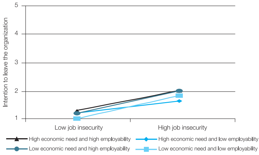
Figure 3. Interaction between job insecurity, economic need and employability in predicting intention to leave the organization

Figure 2 shows the three-way interaction of job insecurity, economic need and employability in predicting organizational commitment. Overall, job insecurity negatively affects organizational commitment, although this effect is